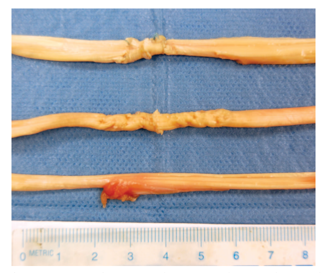
Fig.4. Repair-site distortion with cruciate technique ( above ) and six-core barbed technique ( center ), in comparison with uninjured tendor ( below ).

\ddagger As there is no knot to rupture in barbed groups, \chi^2 analysis was performed by comparing the frequency of suture breakage vs. knot rupture or pullout between barbed and unbarbed groups.