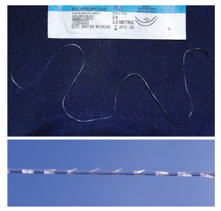
Fig. 1. ( Above ) 2-0 polypropylene barbed suture, double armed with 7-cm antiparallel barbed segments flanking 1-cm unbarbed segment at the midpoint. ( Below ) Close-up view of the barbed segment demonstrating barb orientation.

All barbed suture repairs were performed using 2-0 bidirectional barbed polypropylene suture (Quill; Surgical Specialties Corp., Reading, Pa.) (Fig. 1), which has been demonstrated to have a tensile strength that most closely resembles that of