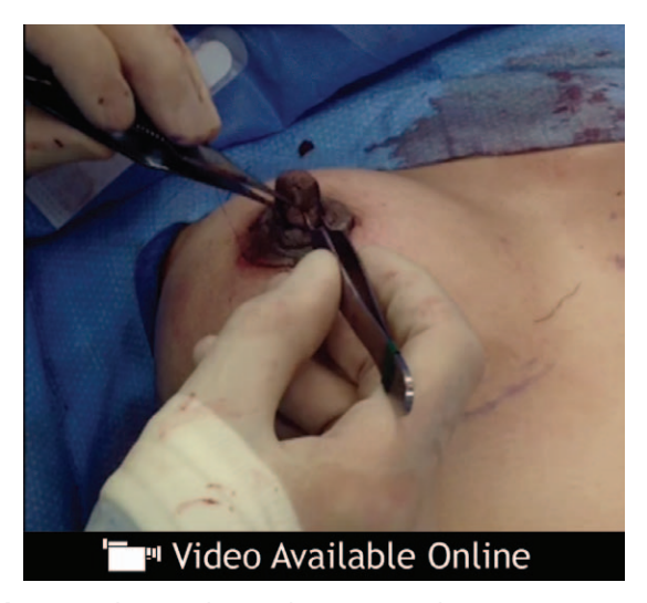
Video. Supplemental Digital Content 1 demonstrates a technique for nipple reduction, http://links.lww.com/PRS/B165 .

The nipple-areola complex holds an important psychological place, as it is the center focus of the breast mound. Just as the absence of the nipple is debilitating, so too is the presence of hypertrophic and/or inverted nipples. The nipple is composed internally of a series of lactiferous ducts that are responsible for connecting the mammary gland and supplying milk during lactation. Nipple sensation is derived from the anterior and the third, fourth, and fifth lateral cutaneous intercostal nerves. Blood supply to the nipple is predominantly from a plexus of vessels branching from the internal thoracic artery.