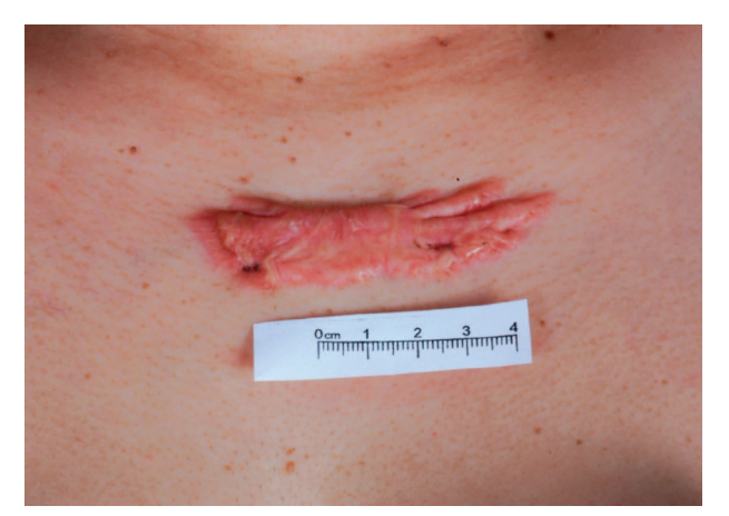
Fig. 3. Keloid on anterior chest wall.

matrix of keloids is abnormal, with elevated levels of fibronectin and certain proteoglycans and decreased levels of hyaluronic acid.<sup>22</sup> Fibronectin and hyaluronic acid are proteins expressed during normal wound healing, and their dysfunctional regulation in keloid contributes to the fibrotic phenotype.<sup>23,24</sup> Biglycan and decorin are proteoglycans that bind collagen fibrils and influence collagen architecture. Keloids have aberrant production of these proteoglycans, resulting in disorganized extracellular matrix and collagen architecture.<sup>25</sup>