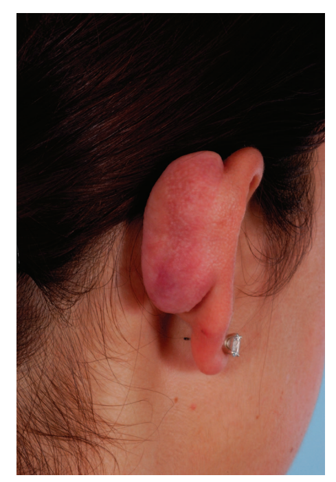
Fig. 4. Keloid on earlobe.

Why is the growth factor milieu in keloids abnormal? Three concepts address why the environment is altered.