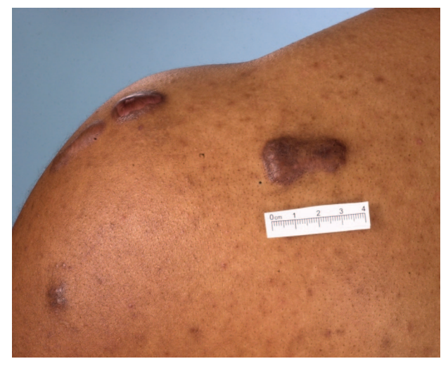
Fig. 2. Keloids classically occur on certain parts of the body, specifically, on the shoulder, anterior chest wall, and earlobes. Surface tension and sebaceous gland density are among the characteristics that have been hypothesized to predispose these anatomical sites to keloid formation. Image shows keloid on the shoulder.