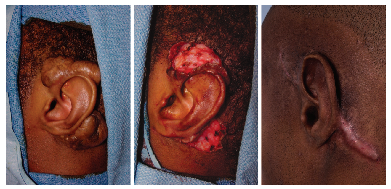
Fig. 8. Serial views of a subtotal surgical excision of a large keloid around the left ear. ( Left ) Preoperatively; ( center ) after surgical excision; and ( right ) postoperatively after primary closure.

different excisional strategies did not find merit in subtotal excision,<sup>96</sup> and currently both subtotal and complete surgical excision are practiced.