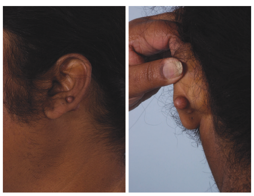
Fig. 5. "Dumbbell" keloid on earlobe.

Collagen content in keloids is elevated compared with normal tissue or scar.<sup>17</sup> Light and electron microscopic studies demonstrate that collagen in keloids is disorganized compared with normal skin. The collagen bundles are thicker and more wavy, and the keloids contain hallmark "collagen nodules" at the microstructural level.<sup>30,31</sup> The ratio of type I to type III collagen is increased significantly in keloids compared with normal skin or scar, and this difference results from control at both the pretranscriptional and posttranscriptional levels.<sup>15</sup>