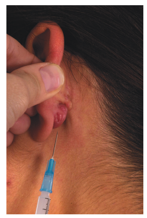
Fig. 7. An earlobe keloid is injected with steroid (triamcinolone acetate) using a syringe with a 25-gauge needle.

Triamcinolone inhibits the proliferation of normal and keloid fibroblasts, inhibits collagen synthesis, increases collagenase production, and reduces levels of collagenase inhibitors.<sup>83,86-89</sup>